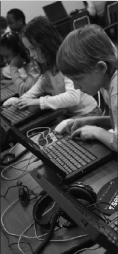
More than 4,800 networked computers are available in our district to help students develop technology skills.