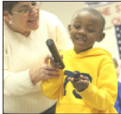
Teachers using innovative strategies to address student learning styles.