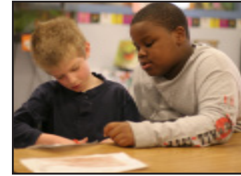
Students engage in learning.

Great people working together for children—the reason you'll love being a part of Lancaster County School District.